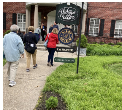
Right: North Central Section attendees arrive at Blade and Bow, Garden and Gun Club. (Don't even ask!)