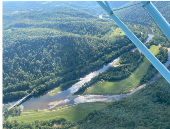
This is cheat river 56WV